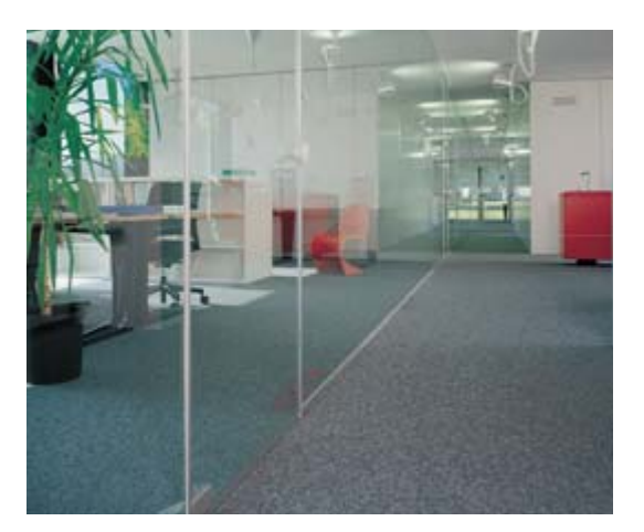
Planet KG – application in an office building