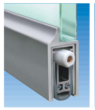
Planet KG-D10, pasted from the bottom