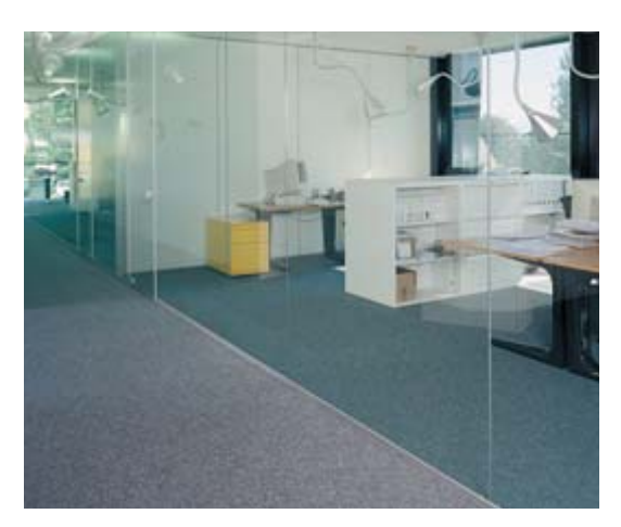
Assembly in all-glass doors and partitions