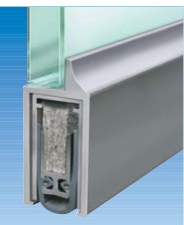
Planet KG-D10, pasted from the bottom